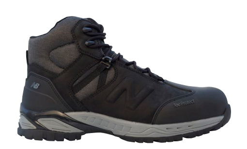
midalls - black / black

The outsole is heat resistant to ver high temperatures (up to at least 300°C for 60 seconds).