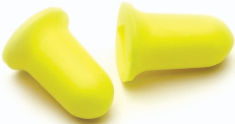
EPYU- PROBELL UNCORDED