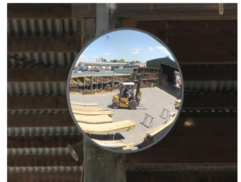
▶ Industrial Safety