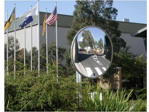
▶ Pedestrian Crossings