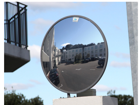
▶ Driveways and Carparks